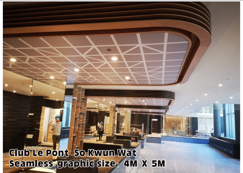
Club Le Pont So Kwun Wat Seamless graphic size: 4M X 5M