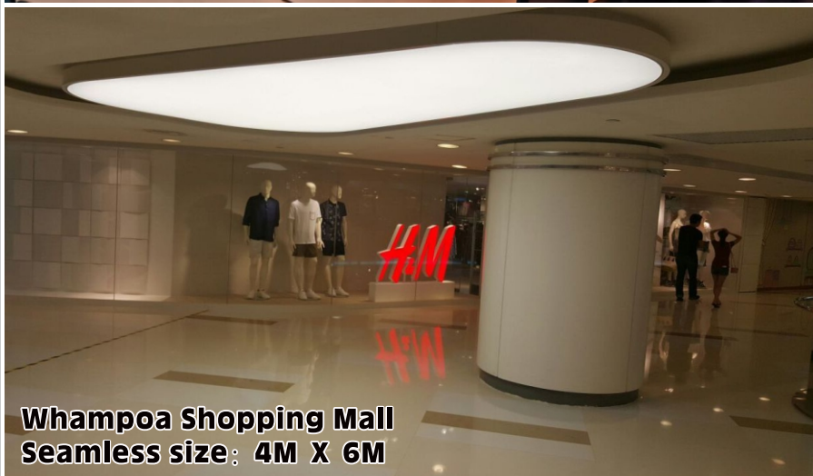
Whampoa Shopping Mall Seamless size: 4M X 6M