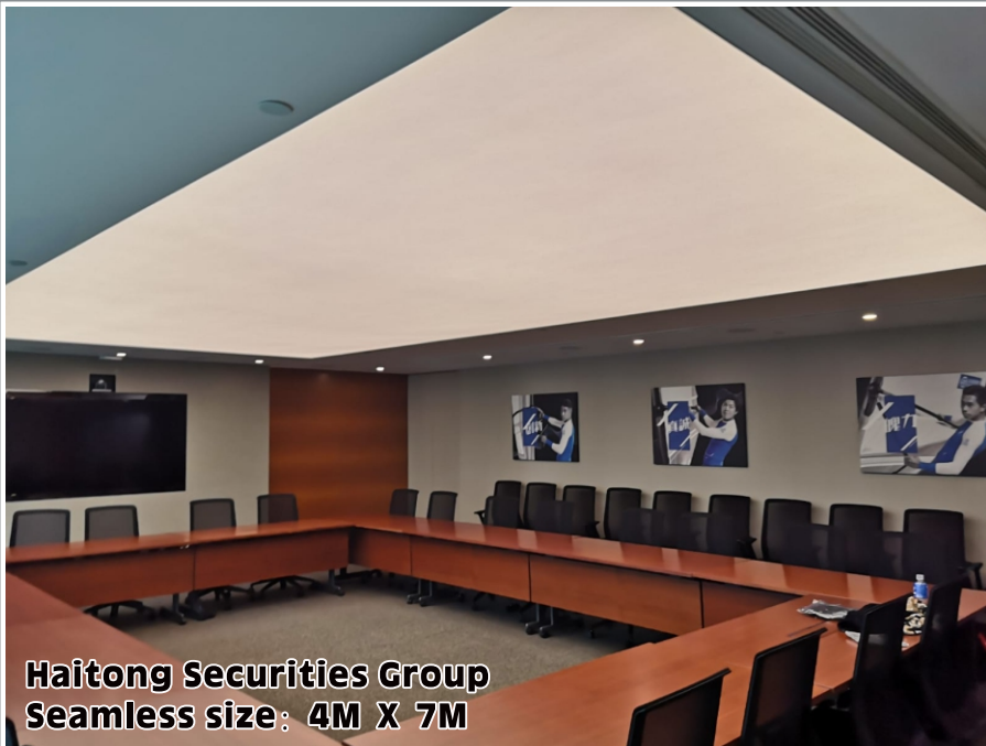
Haitong Securities Group Seamless size: 4M X 7M