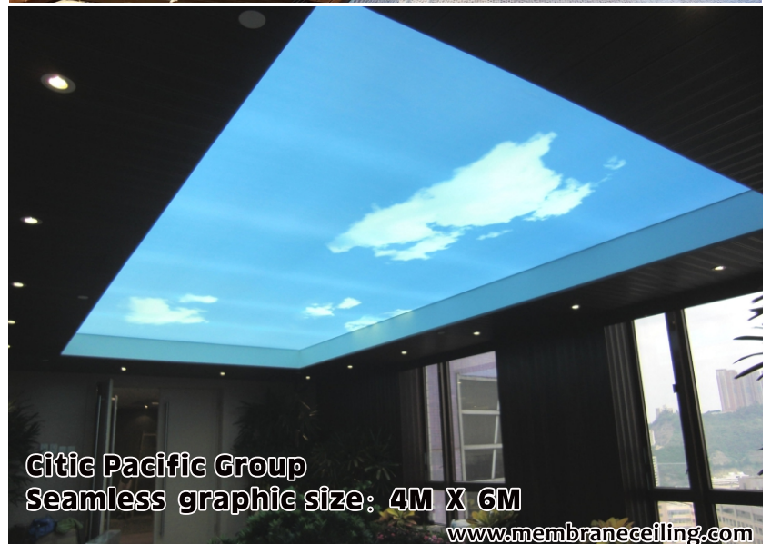
Citic Pacific Group Seamless graphic size: 4M X 6M